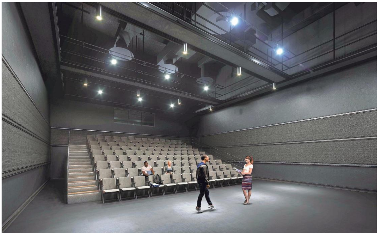
A rendering shows the Gulfshore Playhouse, which is expected to employ nearly 60 full timers, 10 interns/apprentices and more than 400 visiting artists.

Median closed prices in March increased 12.2% to $415,000 (the highest median price increase month/month on record since 2008) from $370,000 in March 2020.