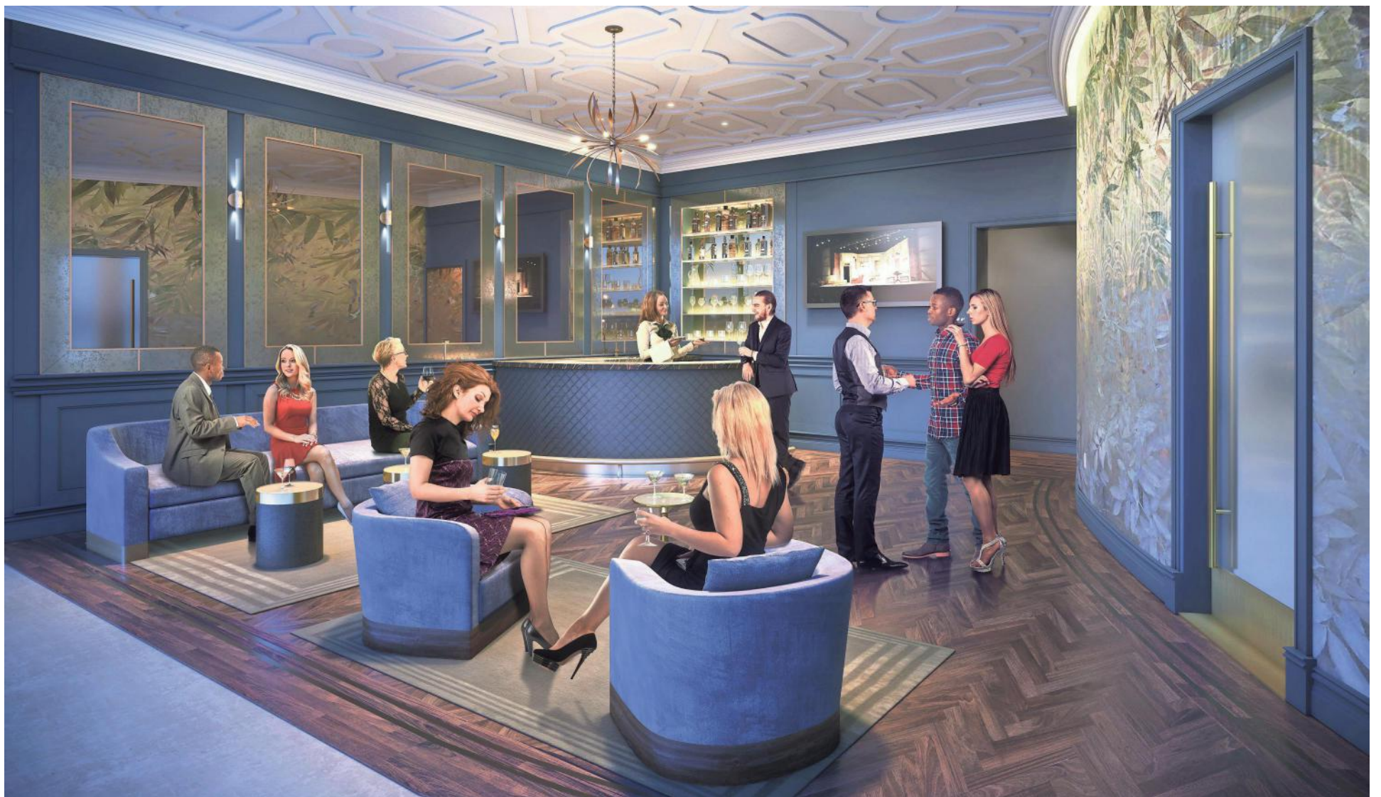
The latest rendering of the Gulfshore Playhouse is shown. Construction is slated to begin in September, with targeted completion of autumn 2023.