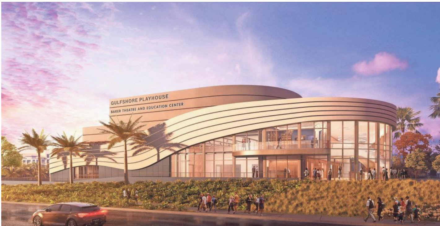
The latest rendering of the Gulfshore Playhouse. Construction is slated to begin in September, with targeted completion of autumn 2023.